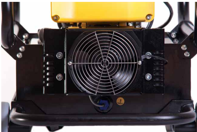
Reservoir heat exchanger