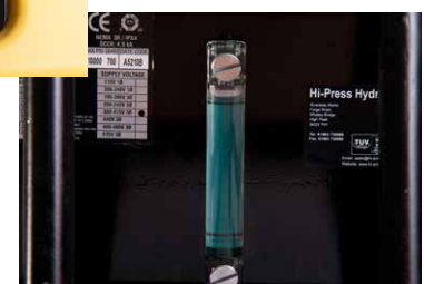
Full sight oil level glass